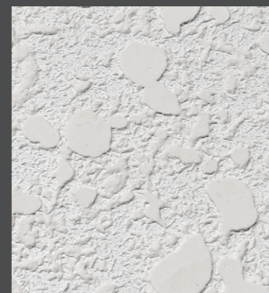
JUMBO-HEAD CUT (L)