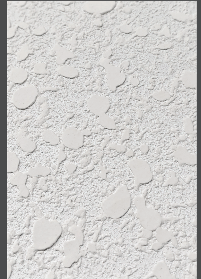
JUMBO-HEAD CUT (L)