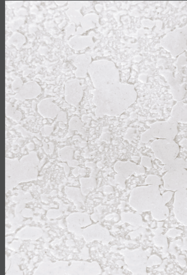
JUMBO-HEAD CUT WITH PU COATING (L)