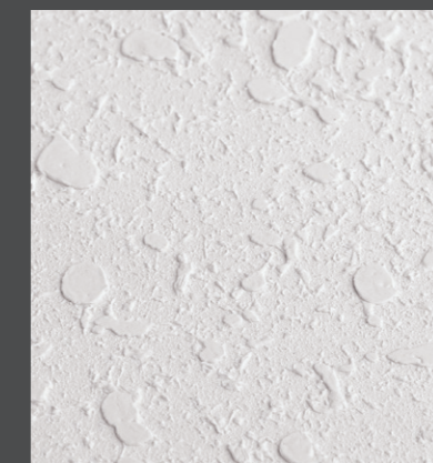
JUMBO-HEAD CUT (M)